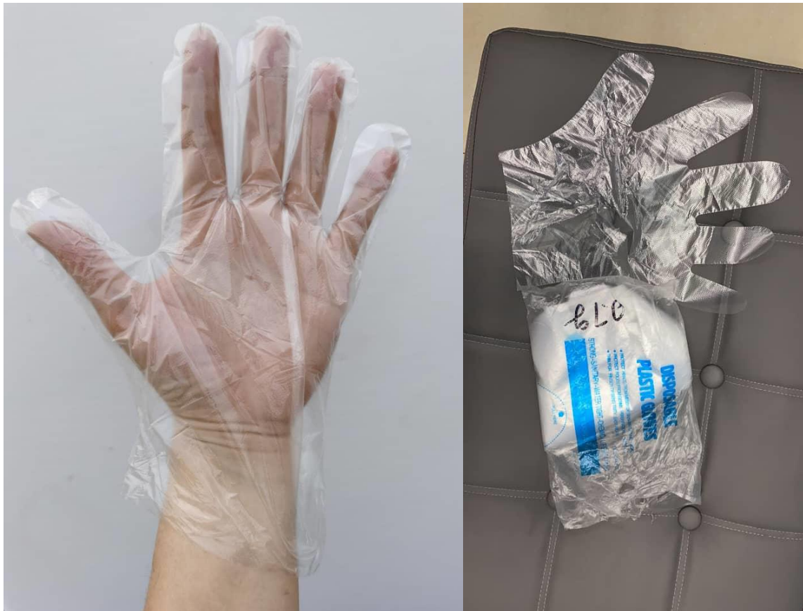
Gloves – Disposable Plastic Gloves – 100pcs in bag